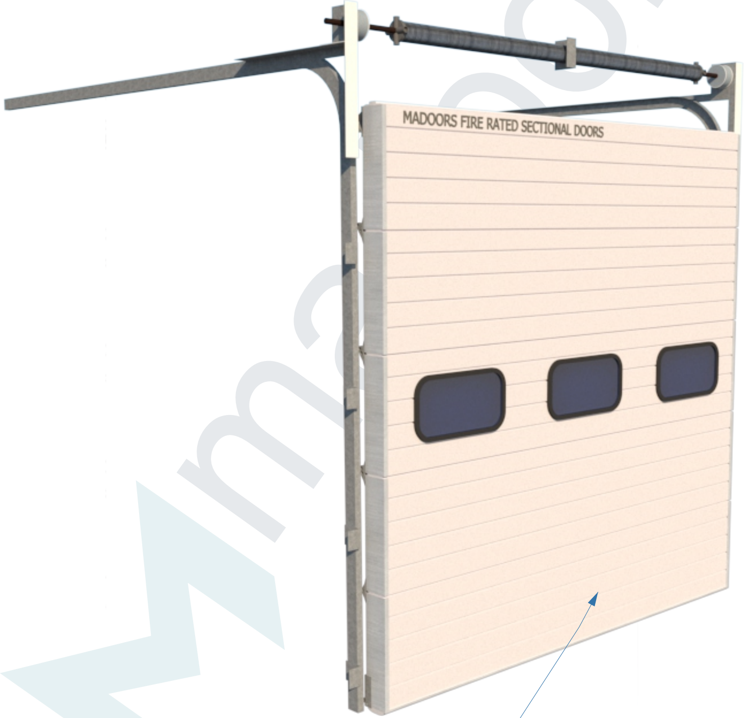
FIRE RESISTANT PANELS